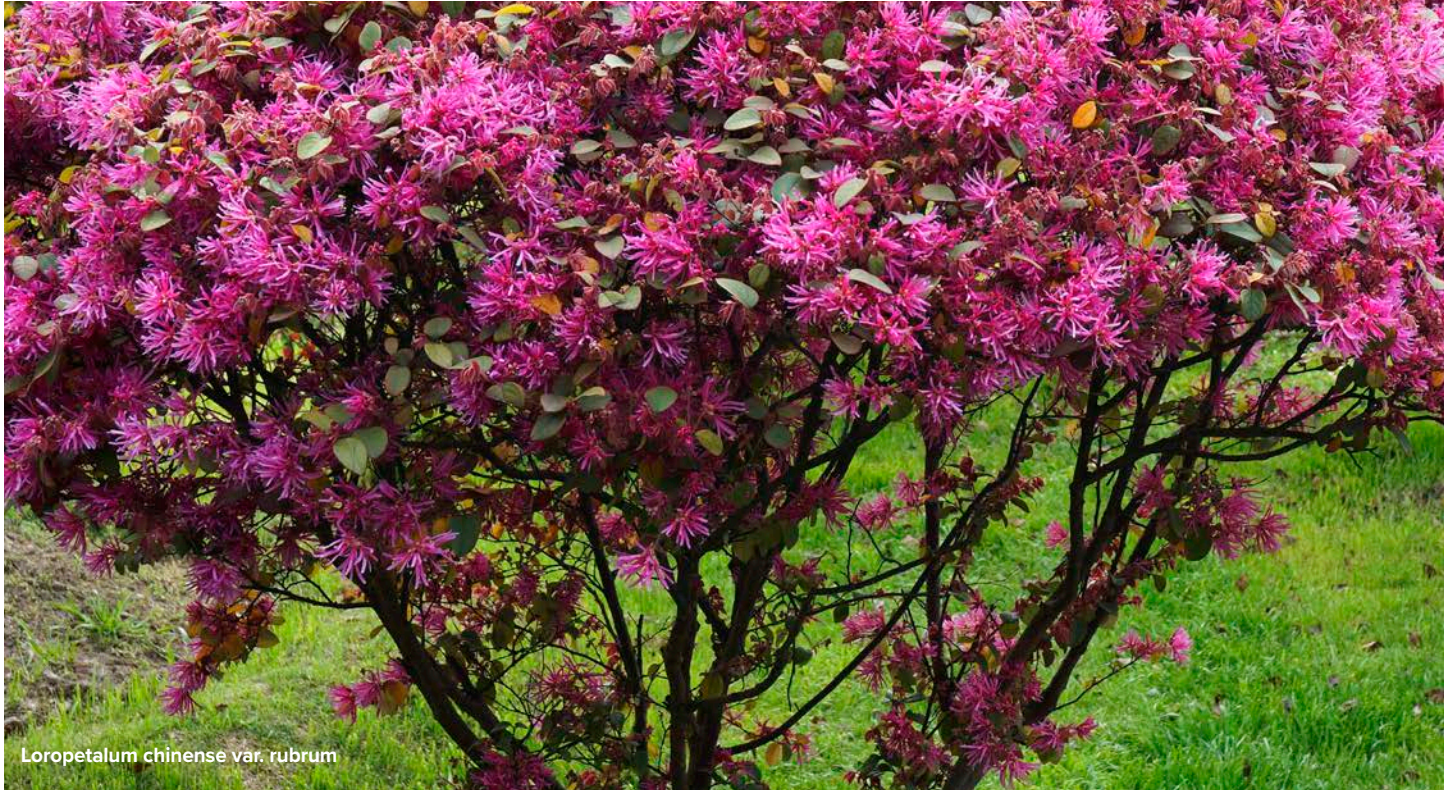
Loropetalum chinense var. rubrum

When designing a landscape, it is important to have a plant pallet with a variety of colors and seasonal interest. Therefore, the Loropetalum is a “go to” plant for the southern landscape. The Loropetalum, also known as the Chinese fringe flower, is an evergreen shrub featuring masses of vibrant blossoms, both purple and white. The flowers are not only stunning but also offer a pleasant fragrance.