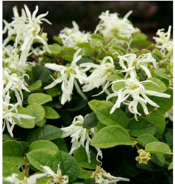
Emerald Snow Loropetalum