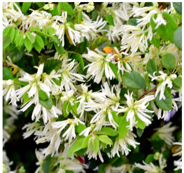
Chinese fringe flower / Loropetalum chinense