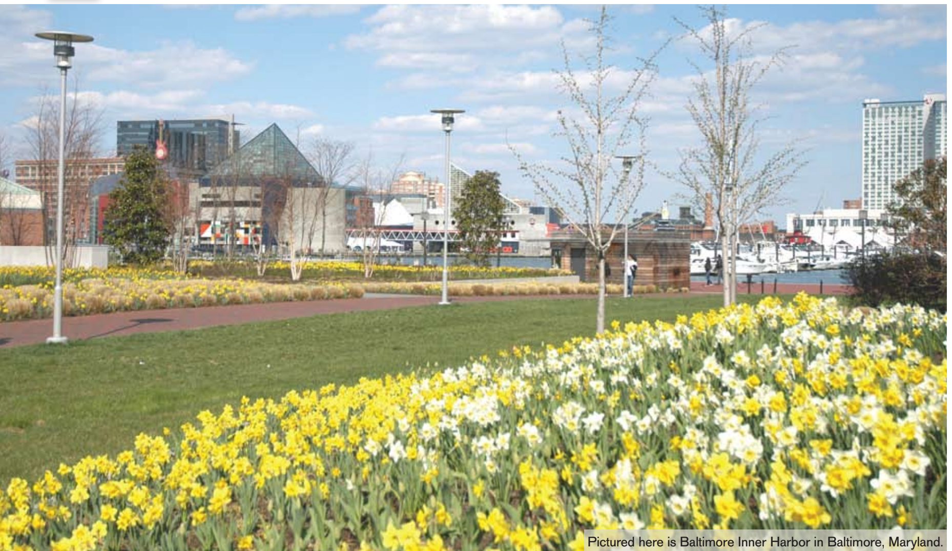
Pictured here is Baltimore Inner Harbor in Baltimore, Maryland.